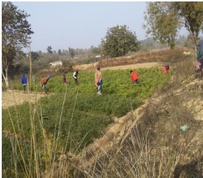
Harvesting the fruits of their labour on 20 th March .