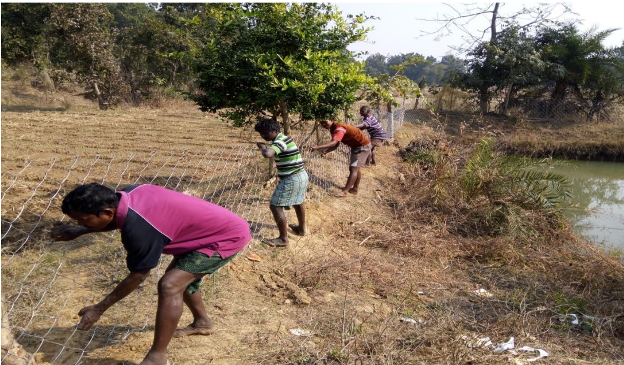
“2.5 acres of land fencing by Patiaora villagers”

Different times the villagers and the SHG members have asked SSS workers to facilitate to start income generation activities in the village. With the help of staff many times lobby and advocacy with line department was done but due to shortage of fund with the Departments it was very difficult to initiate continues vegetable cultivation after the paddy is cropped. As a result they prepared a proposal in their village Gram Sabha for wire fence and approached Samajik Seva Sadan to provide.