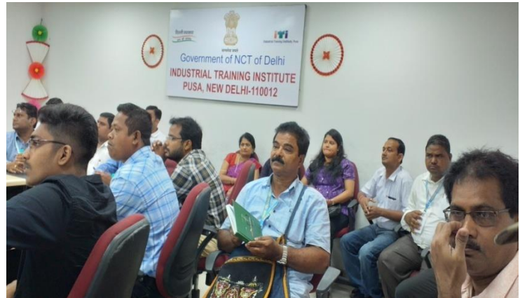
First year trainees learning Practical.