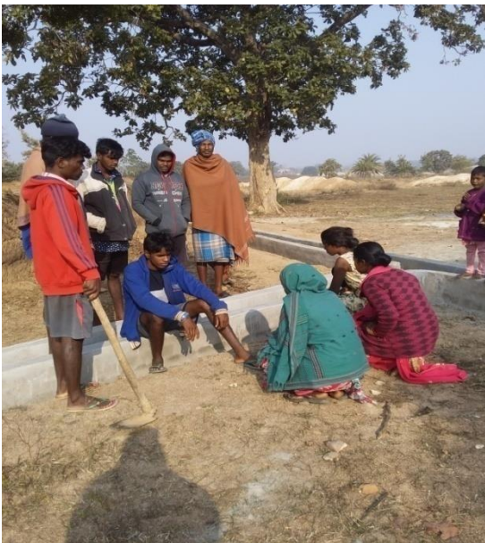
After completion of the channel, they are discussing on 27 th Dec. how to manage the distribution of water for each farmer.

There was a village meeting between villagers and Samajik Seva Sadan with the support of organisation's social worker. Detailed planning through discussion regarding their farming activities took place. After getting assurance from the people that nobody will go outside for labour work and all will concentrate on continues cultivation their proposal was included in the Budget of 2015-17, Organisation implemented this master project by the help of Andheri Hilfe Bonn with more than 10% contribution by the people. The activities included Intake well, Pump set, Water Tank and Pipe for sending water from the intake well to water tank some 200 meters up..