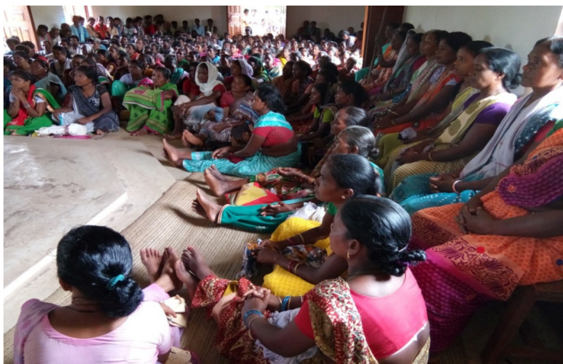
(Gram Sabha meeting at Tedhikaho where in neighbouring villagers too participated)

After getting training VDC members were organised regular Gram Sabha at village level where they discussed their community problems. All together they identified their problems and collectively raise their voice in Panchayat Gram Sabha. Collectively they monitored the developmental activities for quality work like; Sanitary Latrine, Road, Diversion Wall, which were executed in their village, by G.P, Block or from department. Participation of members, specially the women members increased in village Gram Sabha and Panchayat Gram Sabha and made sure that their proposal they had identified at village is enlisted in the Minutes book. On 22 nd December 2016 SSS had organised an awareness program on Forest Land right Act in village Saleghaghra for VDC members of the target village. In the village itself FRA training was organised for understanding the role and responsibility documentation process of FRC committee. After the training they formed FRC committee in their village and processed the file for community right. All the process they completed in three months. In 28 th March 2017 they submitted their document to the administration (Tahasildar) for its approval.