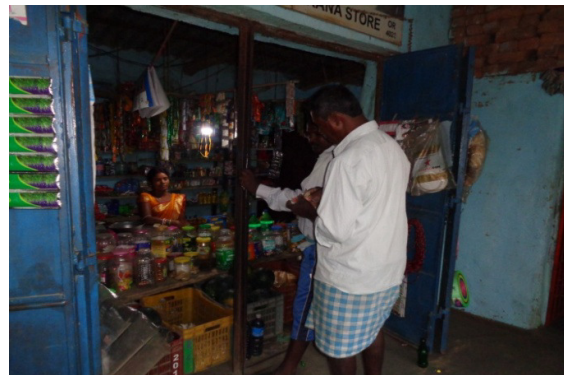
Customers visit the shop within 5 minutes of stay during interaction)

Future Plan for the replication: From this small business her family grew well which was a good inspiration for community people. Now she is planning to have loan for a tractor for her family to have better agriculture and can use for commercial purpose. Such entrepreneurship is replicated in other villages too. SHC of Jamuna has given out loan to 7 other people in 7 other villages under its operation.