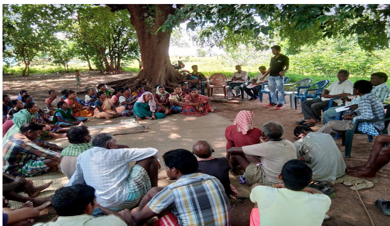
(Protest Gram Sabha meeting on 8 th June 2017 after coming from Collector's Office)

On 9 th of June forester himself came to the village and congratulated President of Gram Sabha saying "You people have won the match".