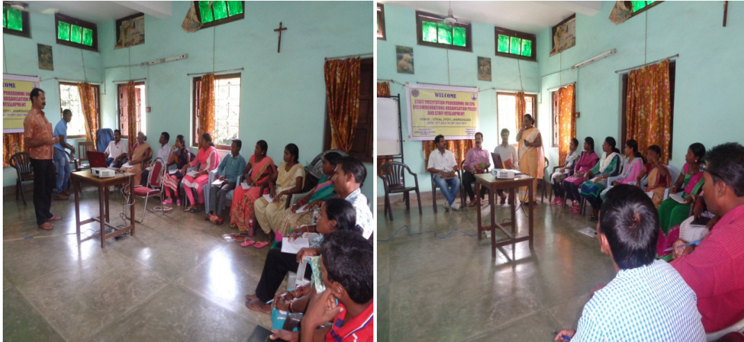
Staff Orientation workshop on Organization Policy at Jharsuguda