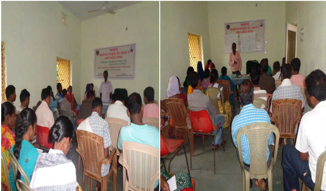
Training of PRI members