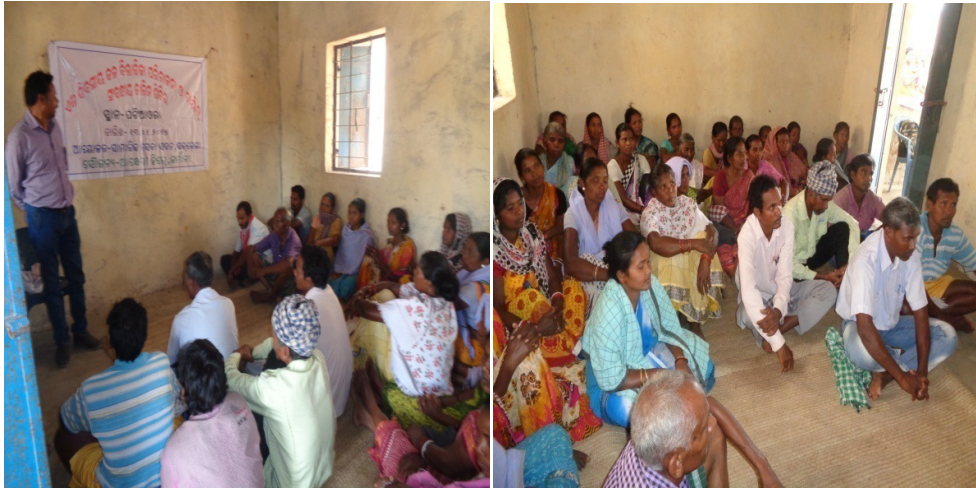
Training of Watershed Management Committee members