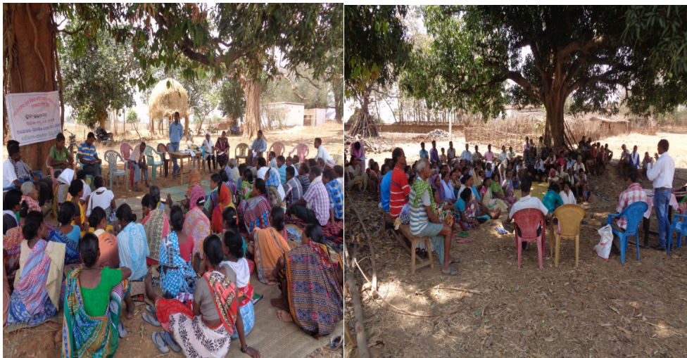
Training of Village development Committee Members in Village