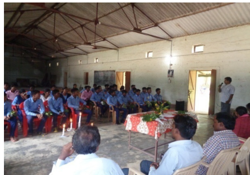
1 st Year Students being welcomed by the 2 nd Year Students of GITI